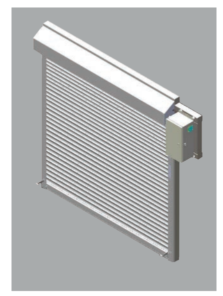
Rendering: Allura® Residential Exterior Shutter system